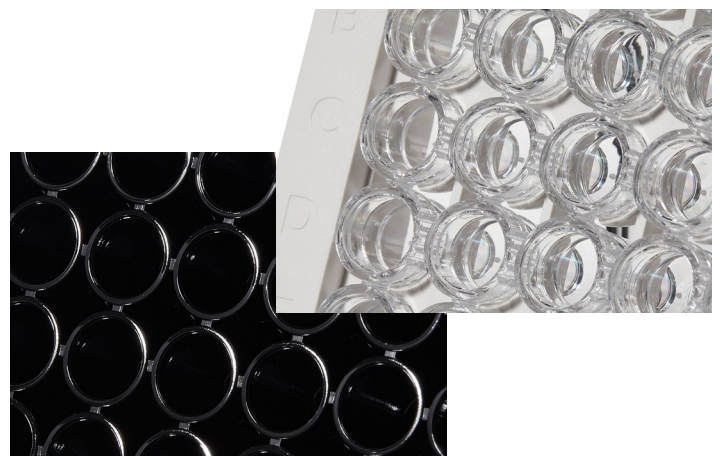
Nunc Strip and Solid Plates

Find out more at thermofisher.com/diagnosticplates