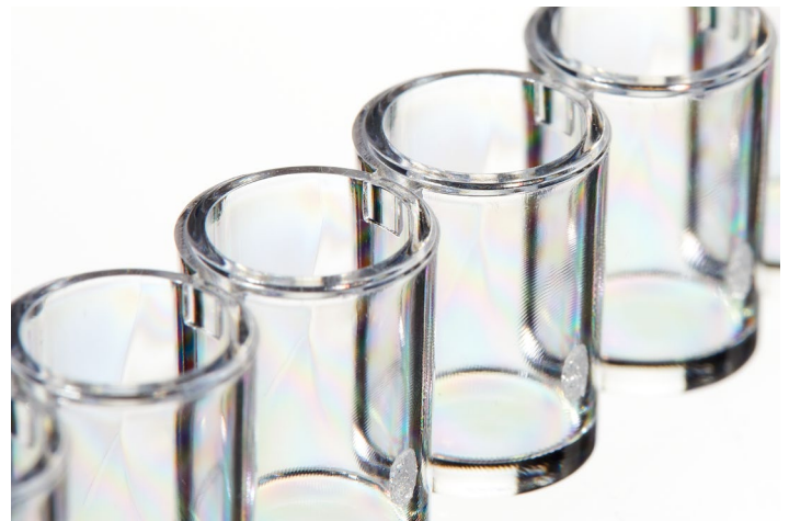
Nunc Strip Modules