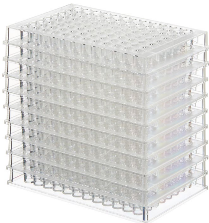
Nunc Immunoassay Plates

Several targets have been identified on SARS-CoV-2 that can be mimicked and used as the capture reagent, more specifically, either the spike protein or a piece of the spike protein. Depending on the target, the Thermo Scientific™ Nunc™ MaxiSorp™ or MediSorp™ Plates, with hydrophilic passive binding surfaces, are ideal for assay development and production through their immobilization of glycoproteins and proteins (Figure 1).